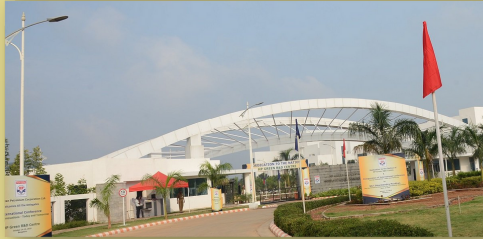
HPCL Green R & D Centre