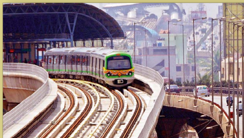
Metro Station, HOPE Farm, Whitefield