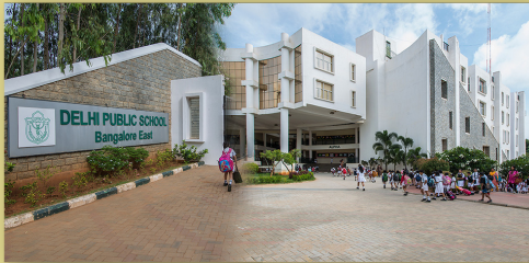
Delhi Public School, East, Whitefield